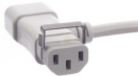
Installs permanently into computer power port with retainer clip