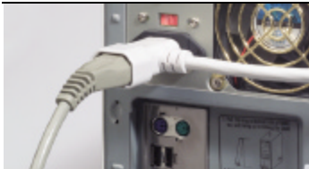
Plugs into computer's power port